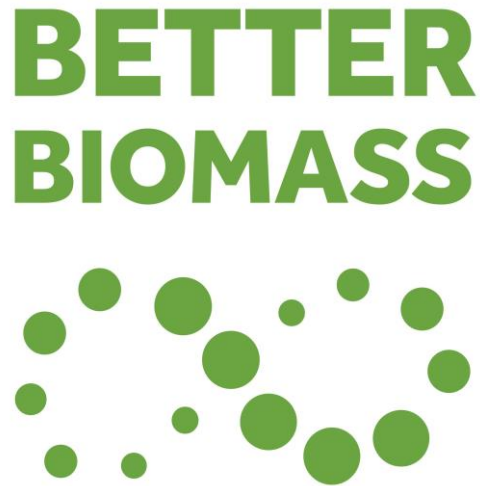
Figure F.3 — 'Better Biomass'-logo for non-certificate holders

The 'Better Biomass'-logo that an organization other than a certificate holder may conditionally use is presented in Figure F.3.