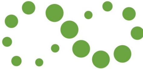
Figure F.3 — 'Better Biomass'-logo for non-certificate holders

The green colour in the 'Better Biomass' logo is specified in Table F.1 with the usual standards. The text in the 'Better Biomass' logo shall be displayed using the font Effra Bold.